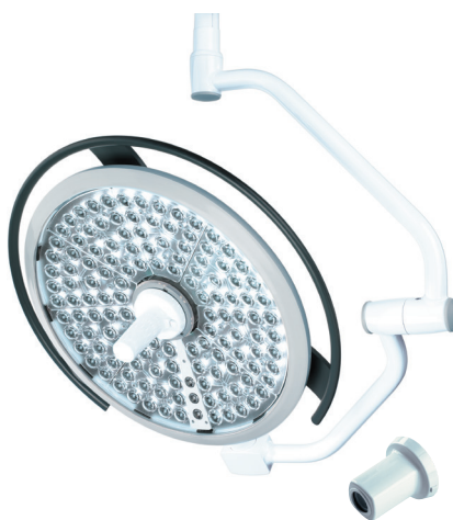
Single or double fork POWERLED 500