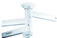
Conventional anchor system