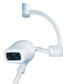
ORCHIDE 3D® HD