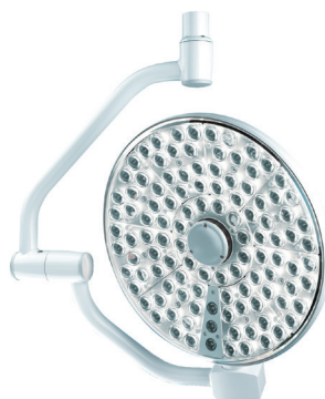
Single or double fork POWERLED 300