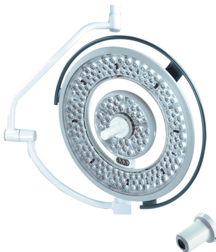
Single or double fork POWERLED 700