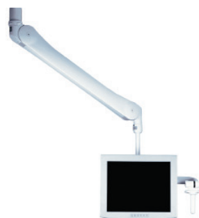
Single flat screen