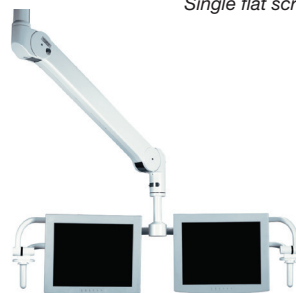
Double flat screen